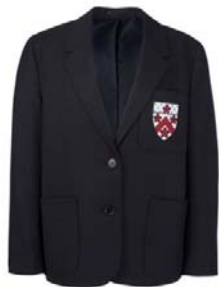
NAVY BLAZER* (as summer) with school badge

There are two types of backs to the blazer: Vents and Closed