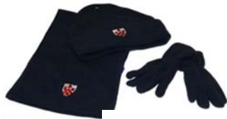
HAT, NAVY GLOVES AND SCARF+