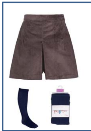
CORD TROUSERS * with CHARCOAL ANKLE SOCKS