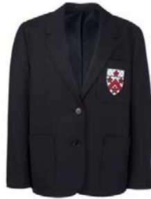
NAVY BLAZER* (as winter) with school badge

There are two types of backs to the blazer: Vents and Closed