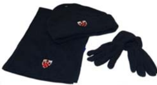
HAT, NAVY GLOVES AND SCARF+