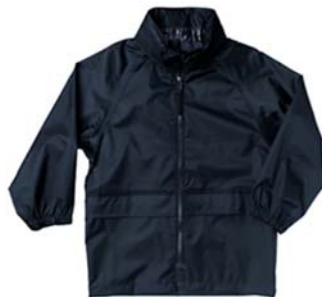
ALLEYN'S JUNIOR SCHOOL COAT*