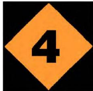
Fig 1 Hazard Division 1.4 Sign

For further information and specifics please refer to the CCF Policy on Fire within the Armoury Compound which is held by the CCF SSI.